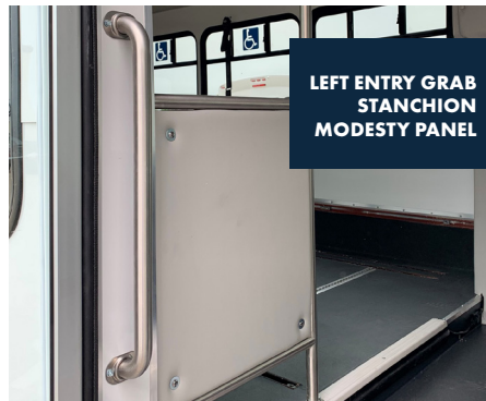
LEFT ENTRY GRAB STANCHION MODESTY PANEL