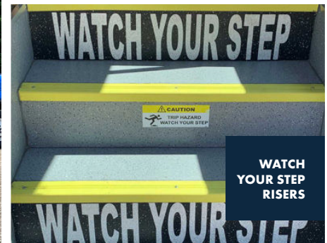
WATCH YOUR STEP RISERS