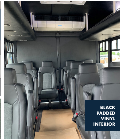
BLACK PADDED VINYL INTERIOR