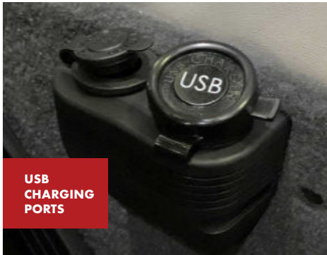
USB CHARGING PORTS