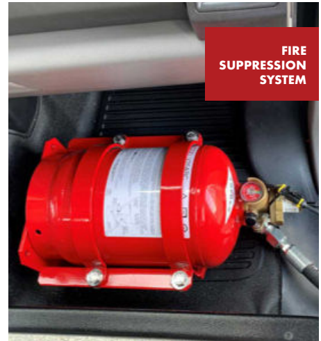
FIRE SUPPRESSION SYSTEM