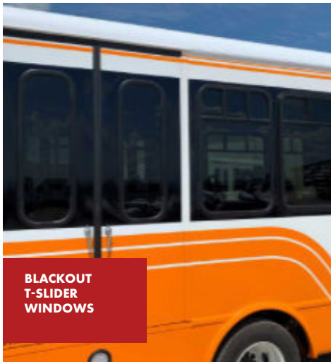
BLACKOUT T-SLIDER WINDOWS