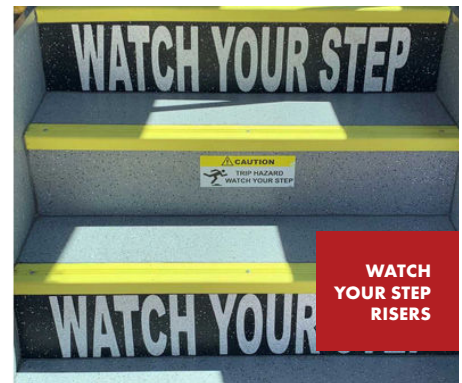
WATCH YOUR STEP RISERS