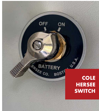
COLE HERSEE SWITCH