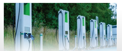
No GEM Charge Cable Needed to Connect