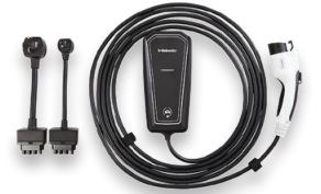
110/120v and 220/240v Plugs Included